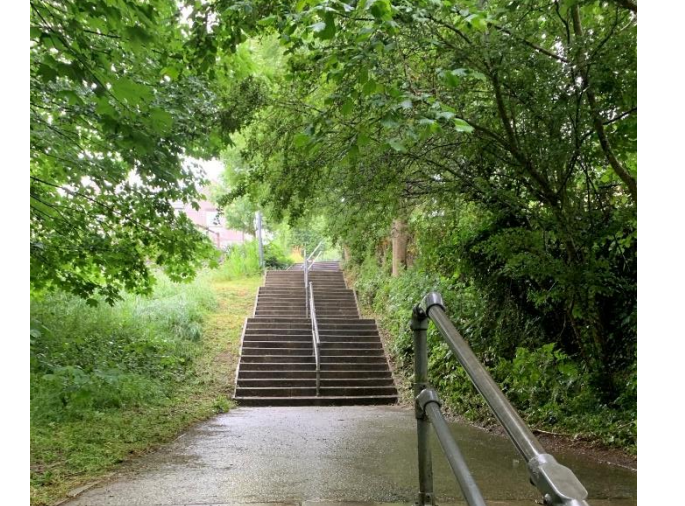
Grassmere Way Play Park – 1 st June 2026